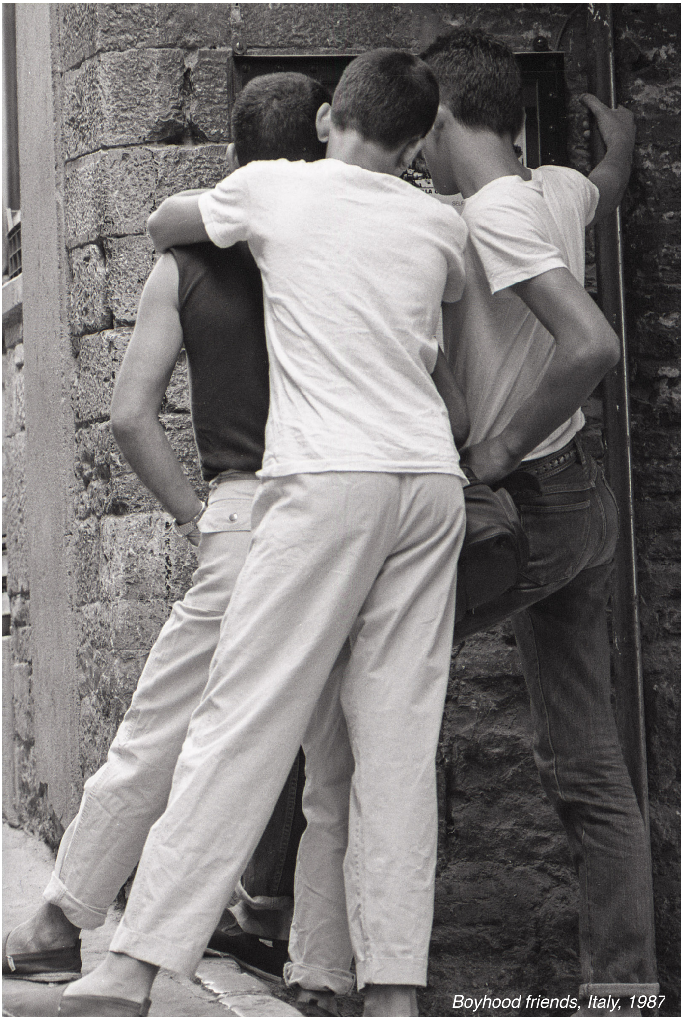
Boyhood friends, Italy, 1987