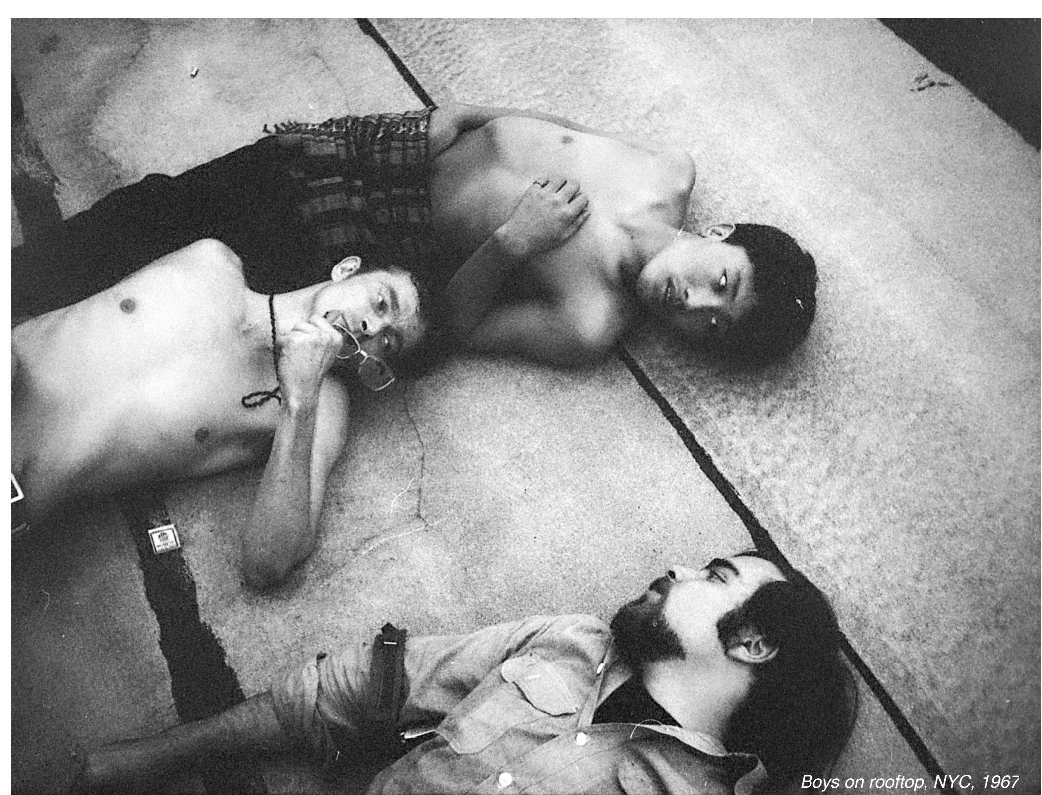
Boys on rooftop, NYC, 1967