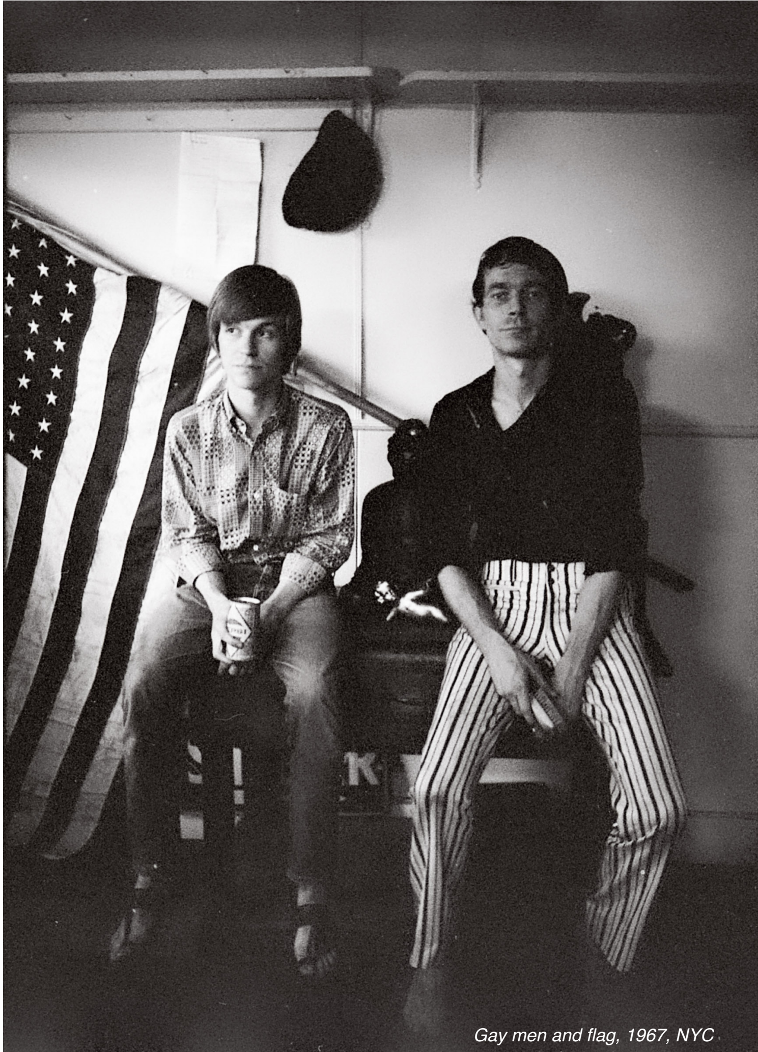
Gay men and flag, 1967, NYC