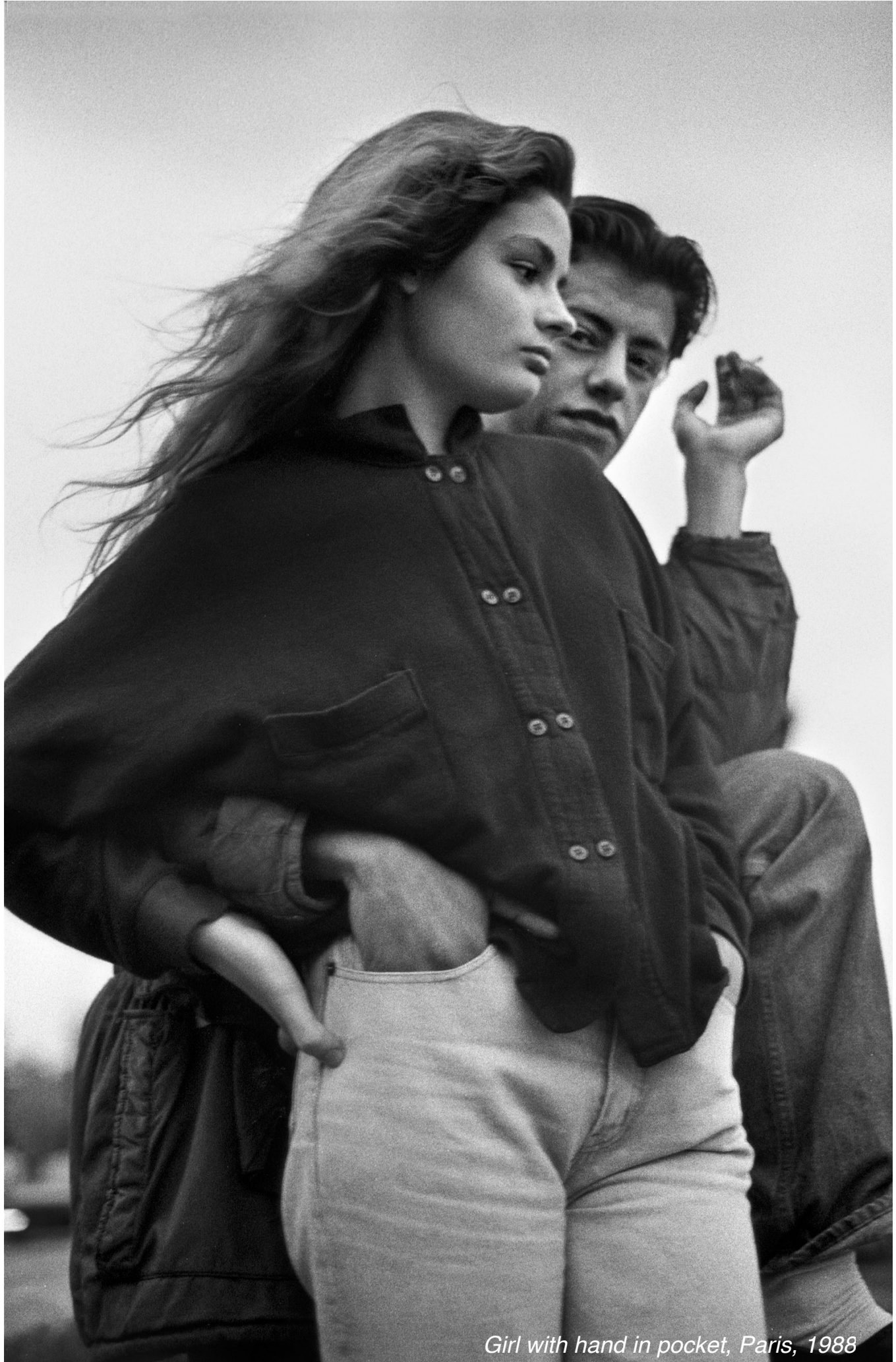
Girl with hand in pocket, Paris, 1988