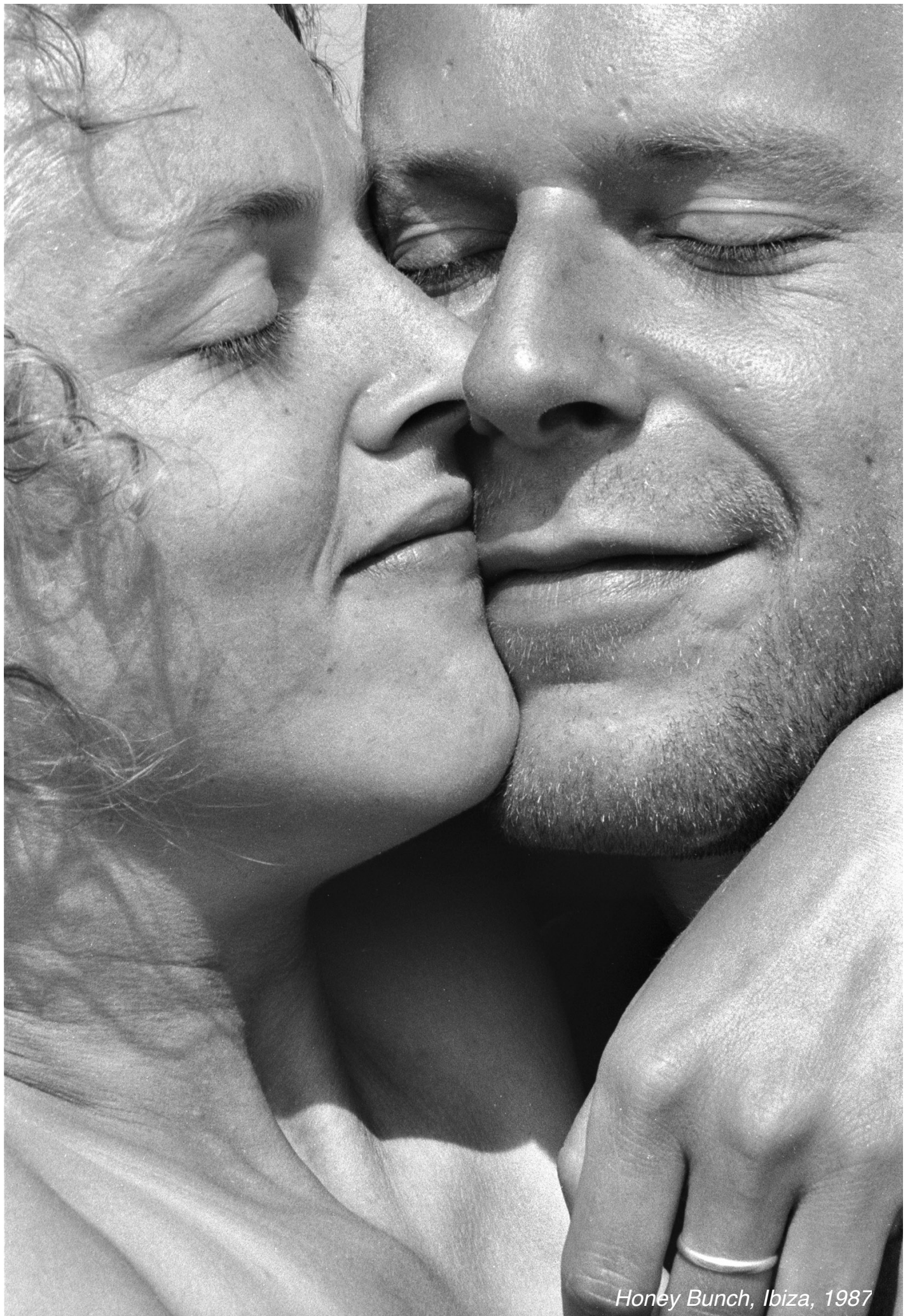
Honey Bunch, Ibiza, 1987