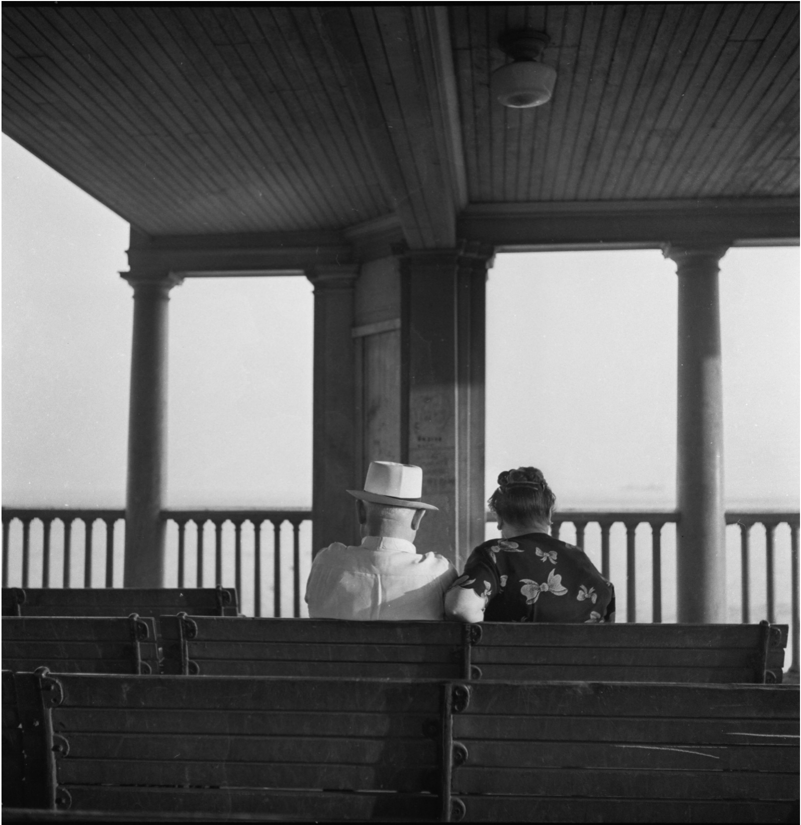
Old Couple under pavillion, 1950