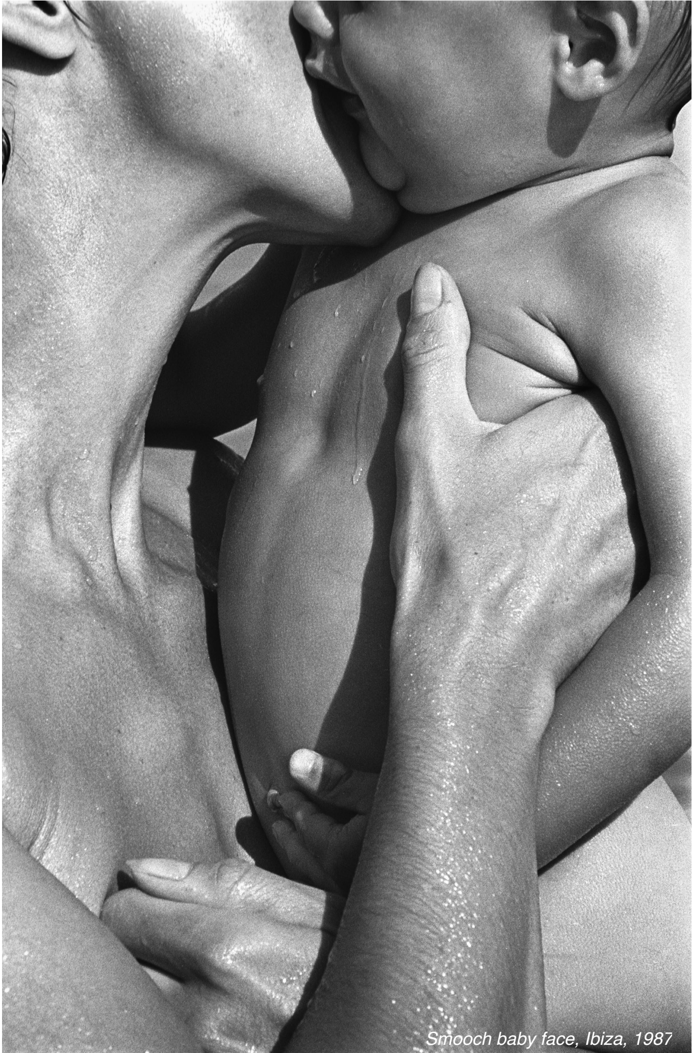
Smooch baby face, Ibiza, 1987