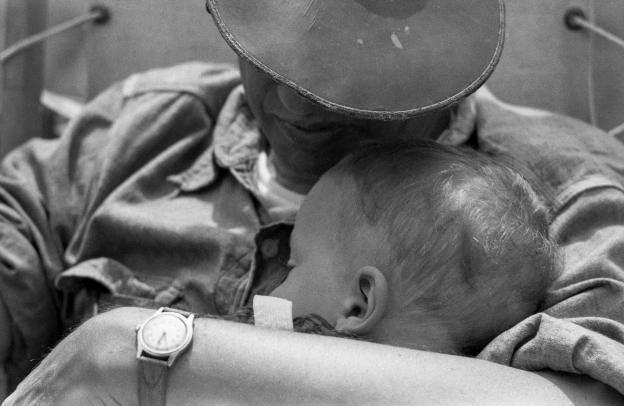
Sid Grossman and his son, 1955