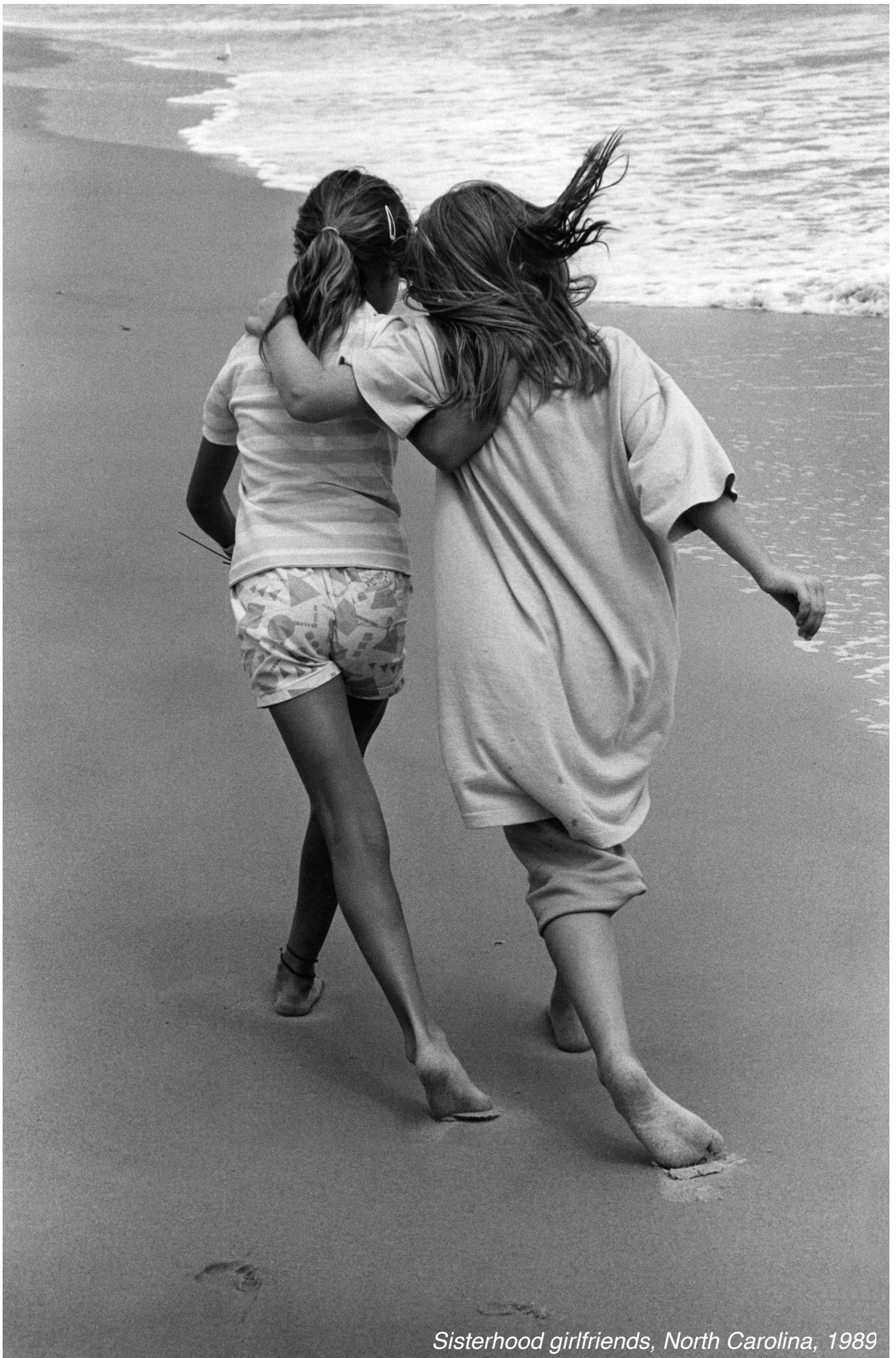
Sisterhood girlfriends, North Carolina, 1989