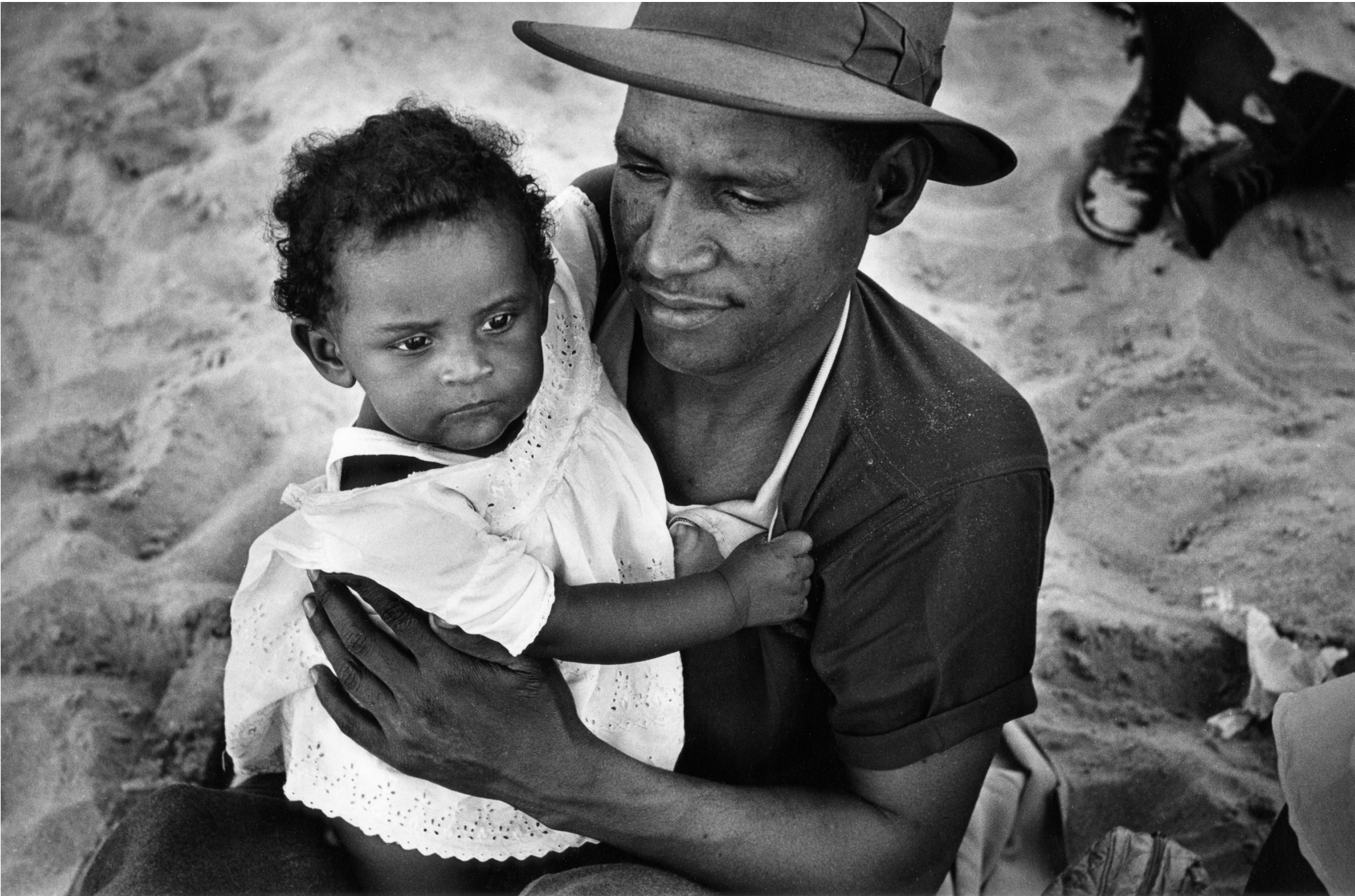
Haitian father and daughter, 1949