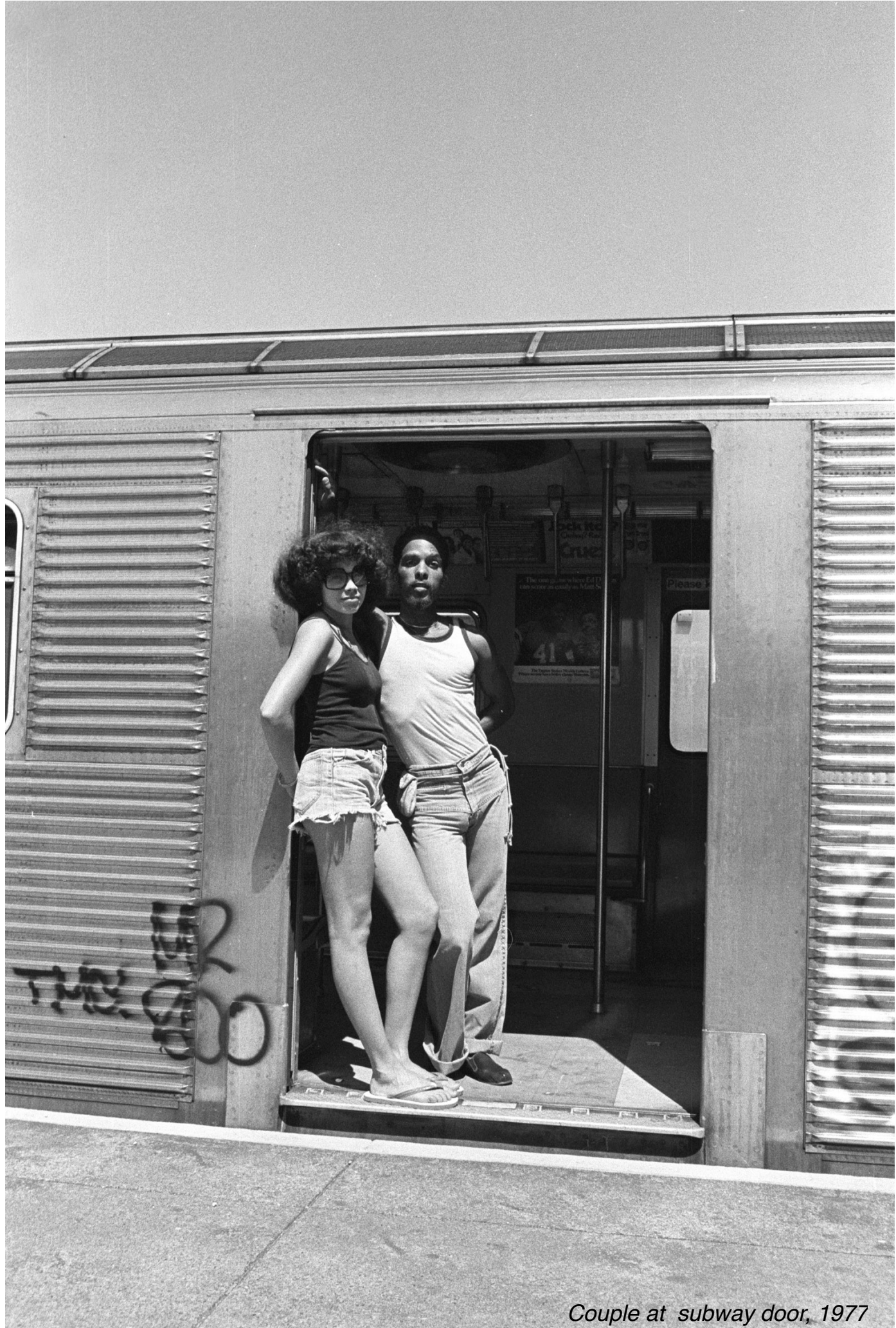
Couple at subway door, 1977