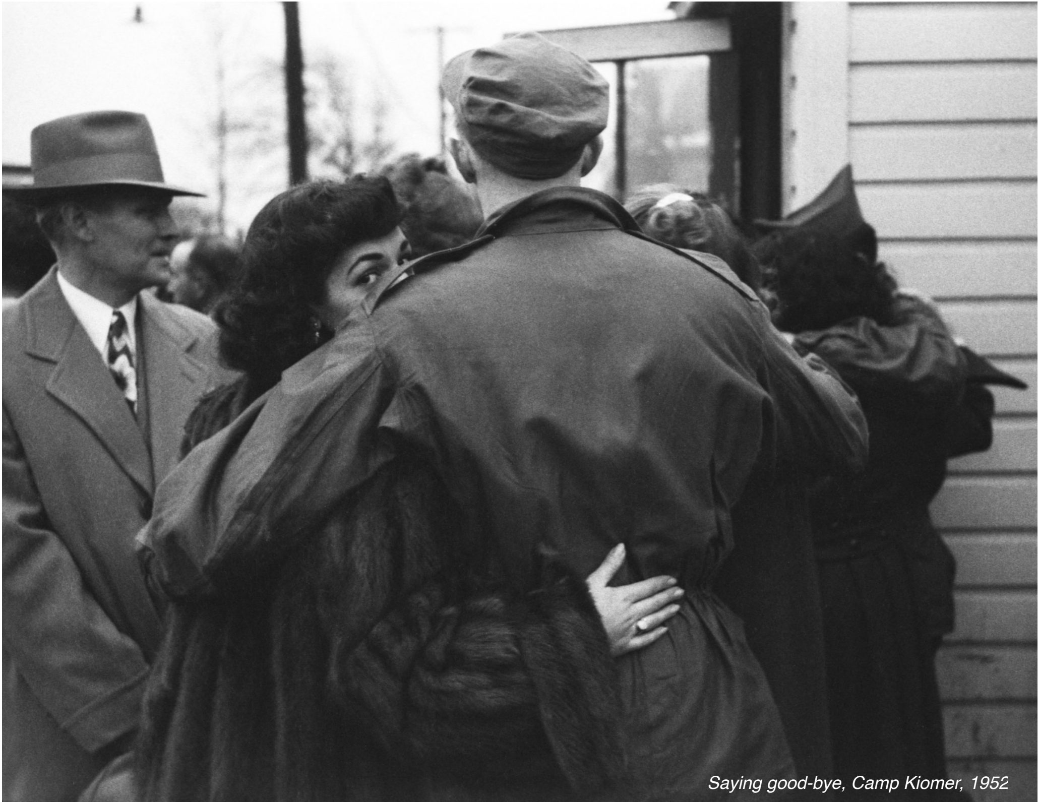
Saying good-bye, Camp Kiomer, 1952