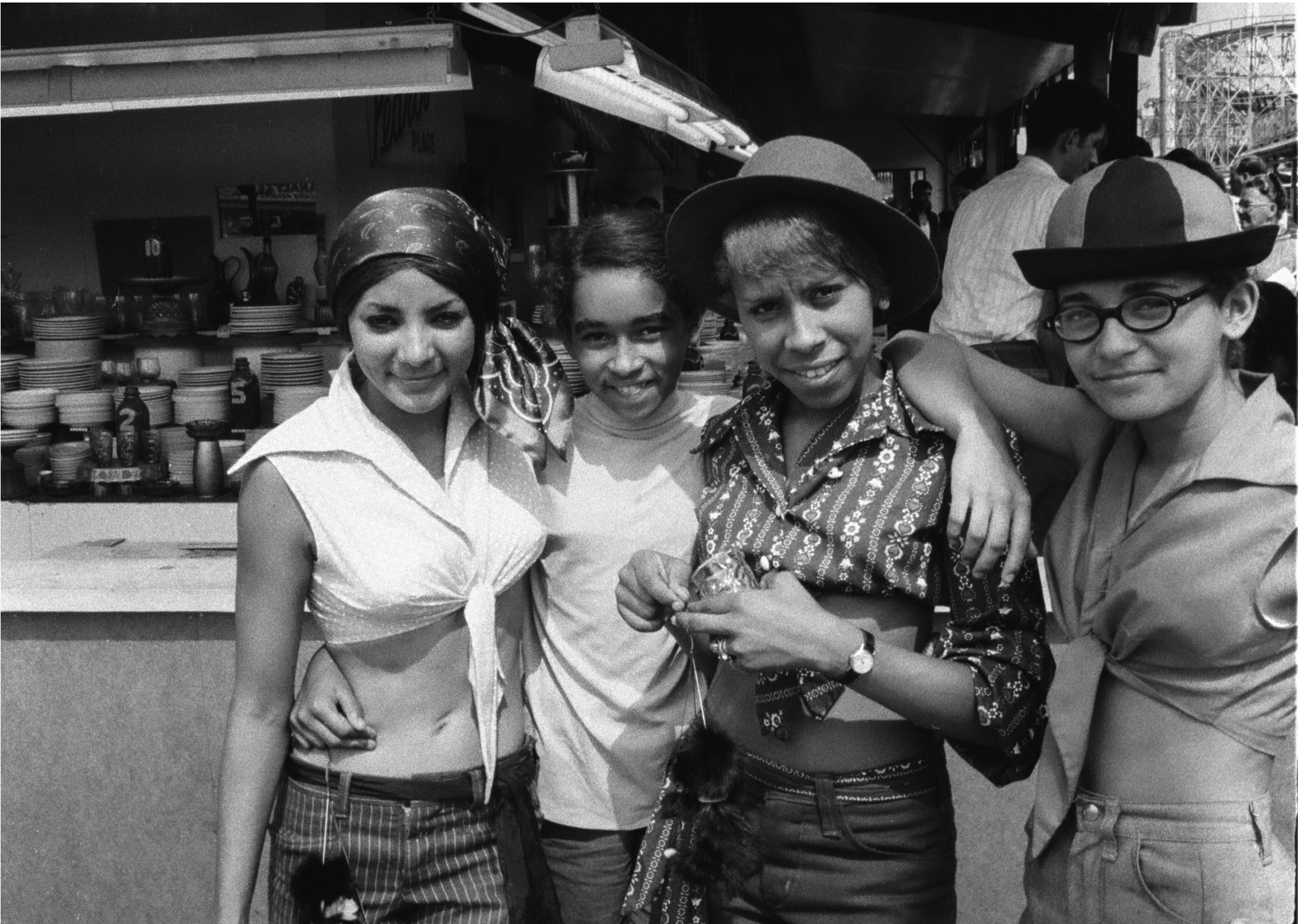
Four girlfriends, 1988