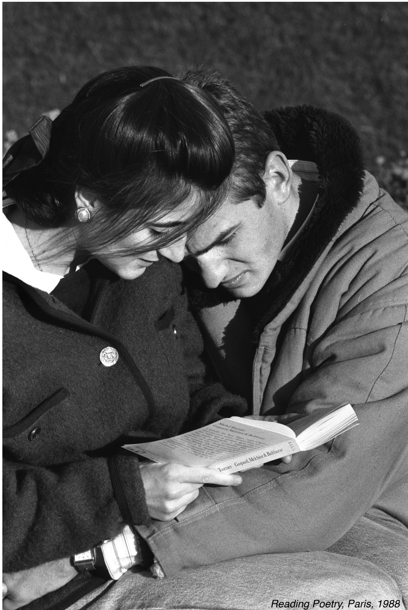
Reading Poetry, Paris, 1988