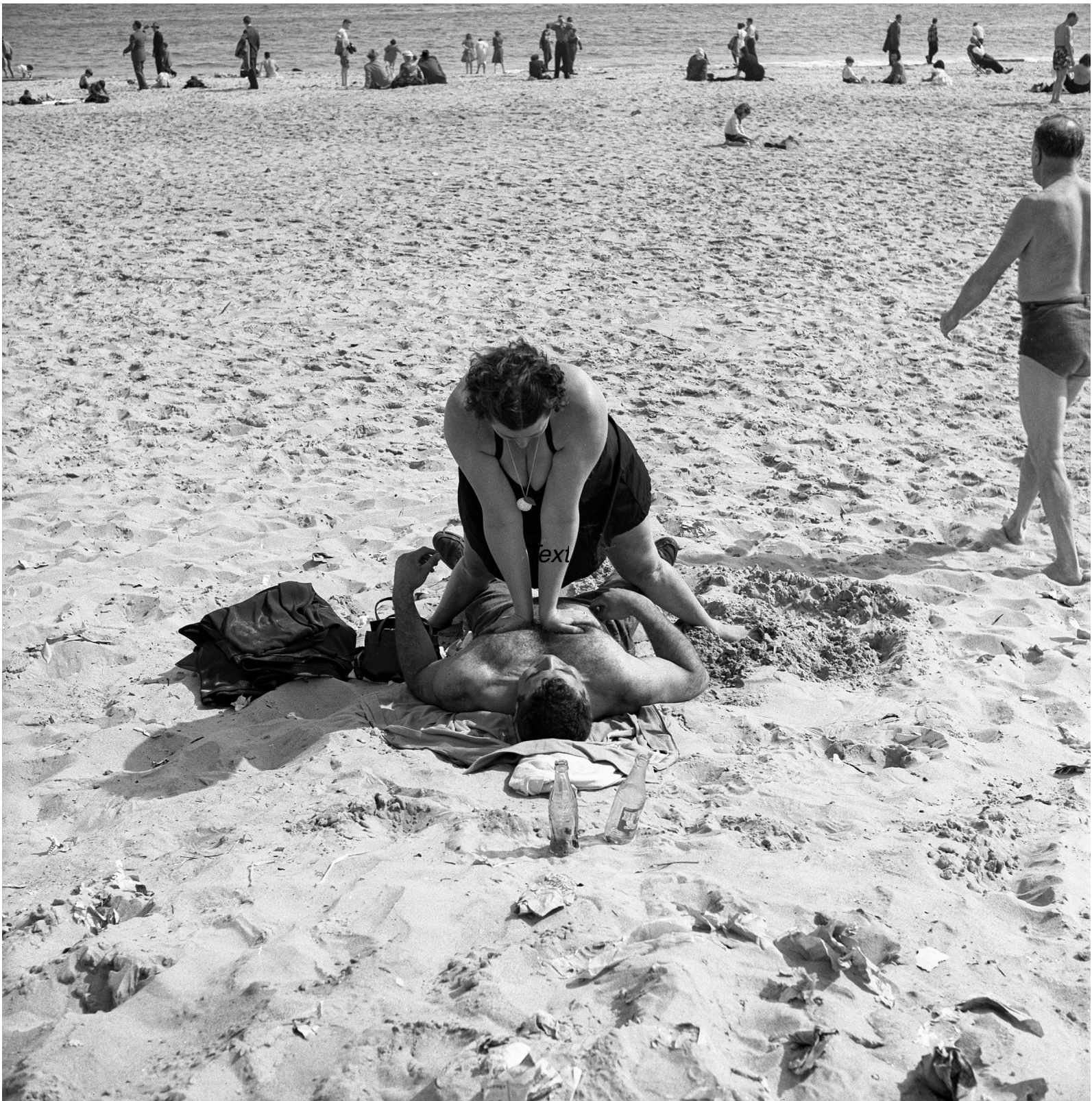
Chubby woman on man's chest, 1949