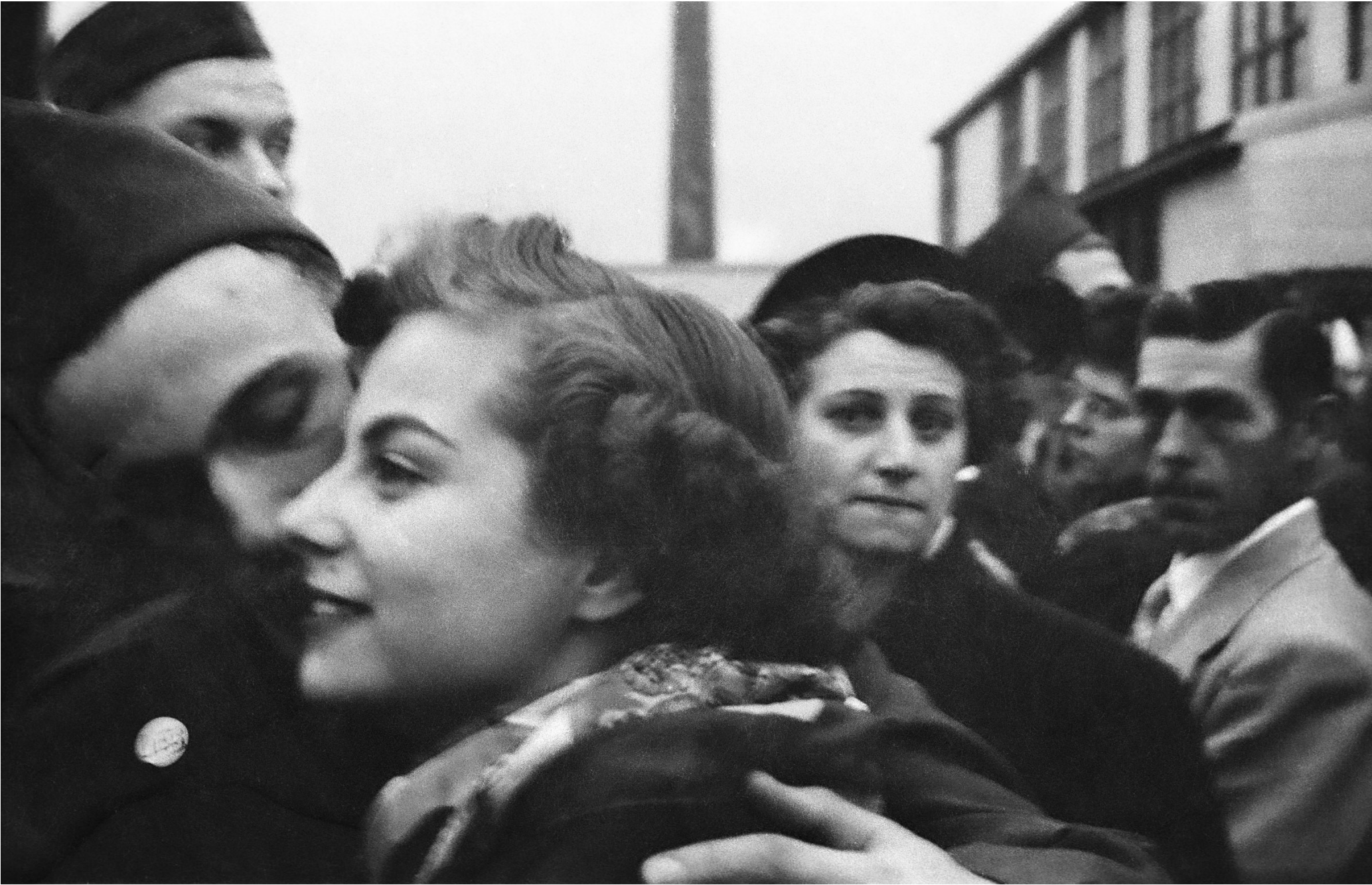
Camp Kilmer Reception, 1952